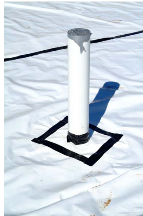
HomeGuard TMB 0.2mm collar (Custom)