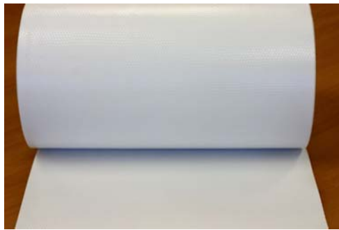
HomeGuard TMB 0.2mm sheet (4m x 50m)